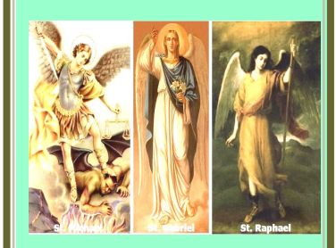
29 September Feast of the Archangels

12 September Holy name of Mary Feast Day